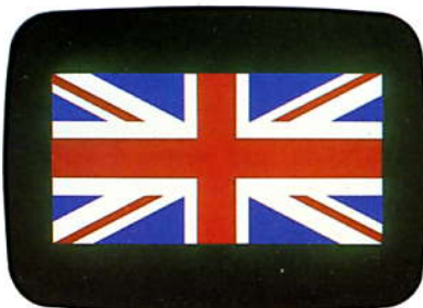
This major advance in computer technology maintains Britain's world-beating position in the field of personal computers.