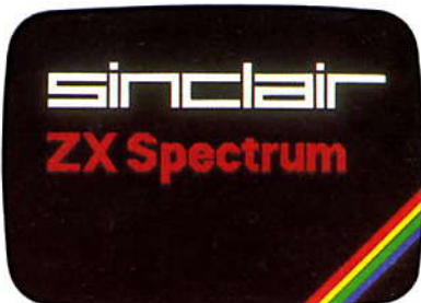
This second generation of Sinclair personal computers demonstrates continuing commitment. Advanced technology made the ZX80/81 family a price breakthrough: advanced technology makes the ZX Spectrum a breakthrough in price and performance.