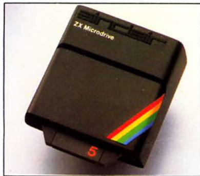
Connect up to eight ZX Microdrives to your ZX Spectrum. Each holds up to 100K bytes on any one microfloppy. Each can transfer at 16K bytes per second – with an average access time of 3-5 seconds.