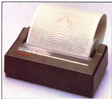
The proven ZX printer – full ASCII character set, printing at 50 cps, with 32 cpl and 9 lines per vertical inch. Reproduces exactly what's on the screen at the touch of a button.