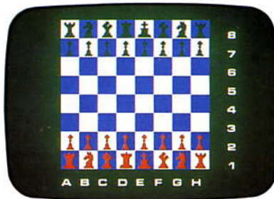
The Sinclair ZX Spectrum can handle sophisticated games programs with high-resolution colour graphics and sound.

already far advanced, and a complete catalogue will be available in the next few months. Subjects will include sophisticated games, education, 'housekeeping', and business management. The more complex packages can, of course, be used to their best advantage with the full 48K RAM version of the ZX Spectrum.