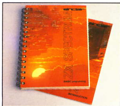
Double-manual system for the ZX Spectrum – slim introductory manual takes beginners through to programming proficiency. Advanced manual smoothes the way through difficult, complex programs.